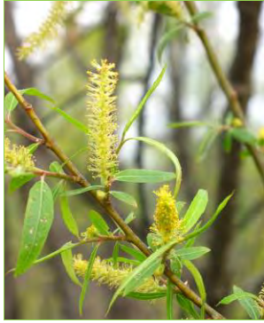
Black Willow Catkins

The biggest tree, a champion black willow, according to The American Forestry Association's Hall of Fame for Trees was in Traverse City, Michigan, with a circumference at breast height of 7.9 m (26 ft-1 in), a height of 25.9 m (85 ft), and a spread of 24.1 m (79 ft) (American Forests, 2008). The estimated life span for black willow averages 65 years with a range of 40 to 100 years (Stringer, 2006).