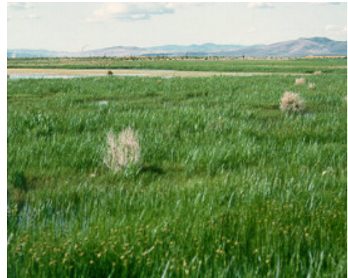
U.S. Fish and Wildlife Service

Winter habitat requirements for long-billed curlews include tidal flats, salt marshes, and other coastal habitats, inland grasslands, and agricultural fields. Winter habitats are occupied following migration from summering grounds. Long-billed curlews roost on the ground in the winter season along the coast on small, sandy off-shore islands, in coastal prairies, and at the edges of ponds, lakes, and other non-flowing bodies of water. Due to varying winter temperatures among curlew wintering areas, availability of common food sources (especially insects) may vary, but cover requirements remain constant. Insect abundance is a major factor in determining where long-billed curlews winter.